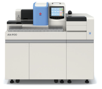
AIA-900 with 9 Tray Sorter