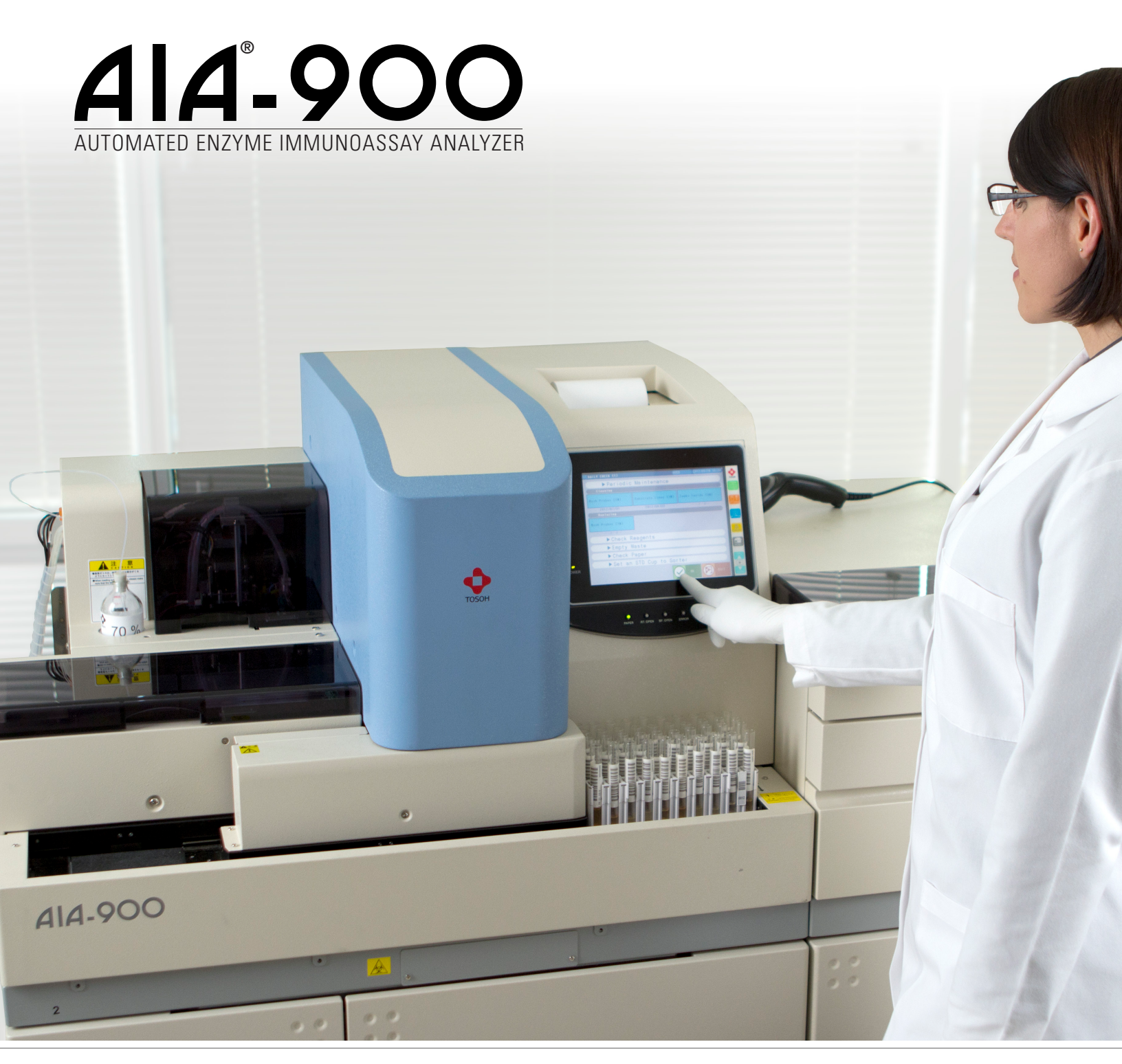
Tosoh Result Integrity • Multi-Tasking Efficiency