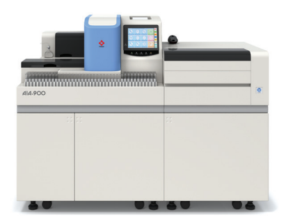
AIA-900 with 19 Tray Sorter